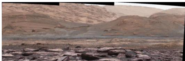
A portion of Mount Sharp, the preserved mound of sedimentary rocks in Gale crater

ABSTRACT: The Mars Science Laboratory rover, Curiosity, landed on the floor of Gale crater, Mars, on August 5, 2012. In the last 5.5 years, Curiosity has traversed over 11 miles (18 km) to explore 1200 ft (370 m) of basin-fill stratigraphy exposed as layered sediments preserved around the crater's central peak, a 16,000 ft (5 km) tall stack of sediments dubbed Mount Sharp.