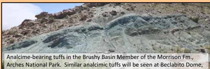
Analcime-bearing tuffs in the Brushy Basin Member of the Morrison Fm., Arches National Park. Similar analcimitic tuffs will be seen at Beclabito Dome, New Mexico, one of the field trip stops.