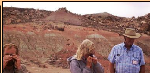
Clinoptilolite-bearing tuff in the Brushy Basin Member of the Morrison Formation, near Moab, Utah. Similar clinoptilolite-bearing tuffs will be seen at the Four Corners National Monument, one of the field trip stops.